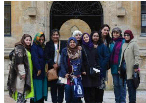
Outside Bodleian Libraries at Oxford University 25th Oct; 2014