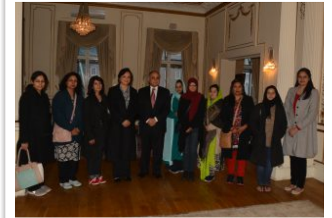
Meeting with Pakistan High Commissioner H.E Syed Ibn-e-Abbas in London 24th Oct; 2014