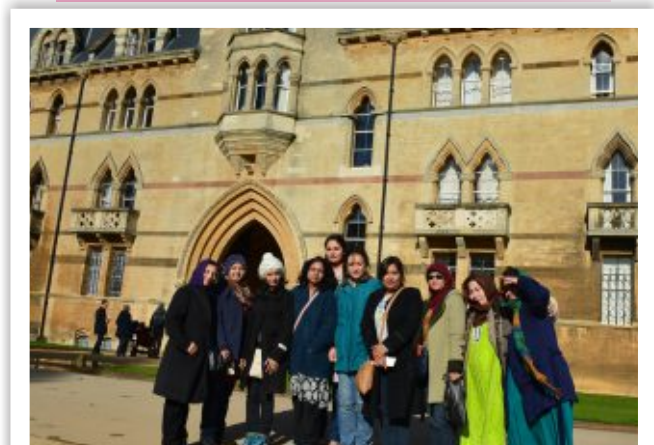
At Christchurch College, one of the 38 Colleges in Oxford University 25th Oct; 2014