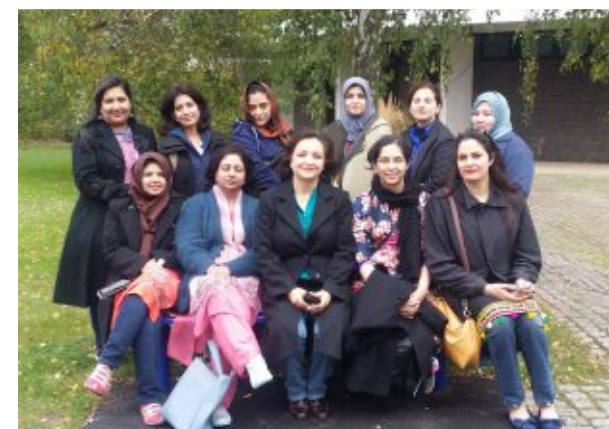
Orientation Day at University of Reading 18th Oct; 2014