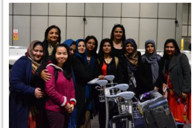
After Landing at Heathrow Terminal 4, London, 18th Oct; 2014